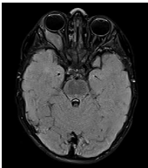
Figure 3. Abnormal mass in magnetic resonance imaging

The causes of unilateral proptosis are diverse among pediatric and adult patients. The most common causes of