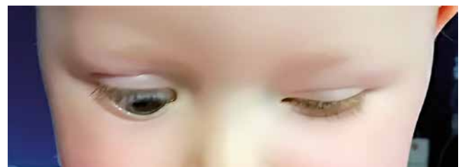
Figure 1. Exophthalmos of the right eye in the nineteen-month-old male patient

time. The patient had no concomitant systemic diseases or symptoms of allergy. During ophthalmological examination, he was diagnosed with right eye exophthalmos with preserved normal motility of both eyes, except for a minor limitation of right eye abduction. Clinical assessment confirmed a minor edema of the superior eyelid without increased skin warmth, redness or other symptoms of inflammation (Figure 1). Biomicroscopy did not identify changes in the anterior segments of either eye and both fundi were within normal limits. Ocular ultrasound showed a thickened lateral rectus muscle of the right eye (Figure 2). Cranial and orbital magnetic resonance imaging identified an abnormal mass (16 × 21 × 33 mm) adjacent to the lateral wall of the right orbit and attached to the lateral rectus (Figure 3). However, the imaging examination did not reveal any inflammatory changes in the adjoining structures. Due to a suspected neoplastic lesion, surgical