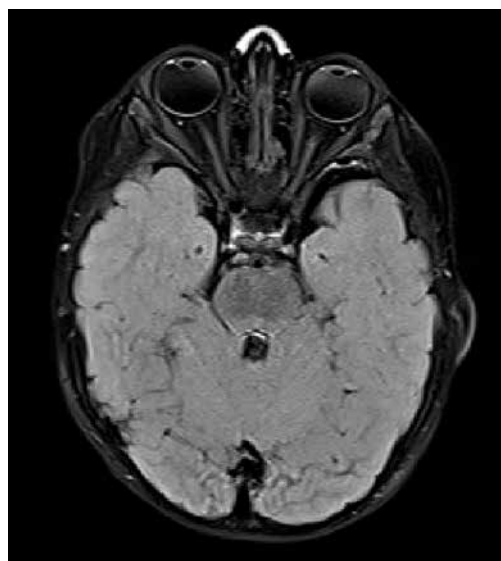
Figure 4. Magnetic resonance imaging result six months after diagnosis of exophthalmos